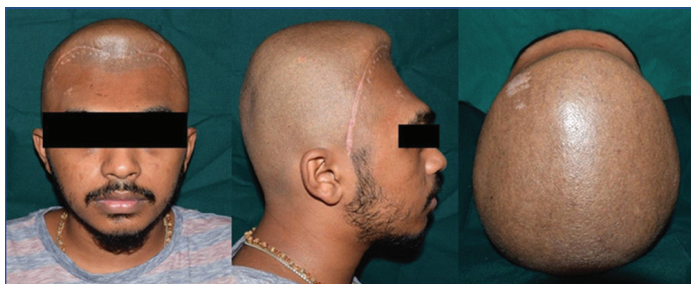
[Table/Fig-1]: Preoperative frontal view. [Table/Fig-2]: Preoperative lateral view. [Table/Fig-3]: Preoperative birds eye view [Images from left to right].

Upon dewaxing, separating medium (Heat Cure Cold Mould Seal, Dental products of India), was painted onto the mould and the mould was packed with heat polymerising clear PMMA resin (Pro Base Hot, Ivoclar Vivadent). The assembly was bench cured and processed using the long curing cycle of eight hours at 74°C [Table/Fig-5a-d]. The prosthesis was divested and immersed in distilled water overnight. The prosthesis was then finished and polished. Perforations of 2.5mm diameter were made all over the body of the prosthesis, 3mm apart from each other, leaving a 5mm margin for fixation. In order to facilitate radiographic detection, shallow rectangular troughs were drilled along the margin measuring 4×0.5×1mm into which light cure composite resin (Tetric N Ceram, Ivoclar Vivadent) was packed [Table/Fig-5d]. The contour was verified externally by a quick visual examination and the prosthesis was immediately delivered to the neurosurgeons for further surgical procedures.