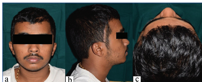
[Table/Fig-6]: Postoperative view: a) frontal; b) lateral; c) bird's eye.

During surgery, the defect was exposed through the existing scar and the autoclaved prosthesis was fixed to the adjacent bone margin. The patient was followed-up over a period of six months post-surgery. No complications were observed and the patient was satisfied with the outcome of the procedure [Table/Fig-6].